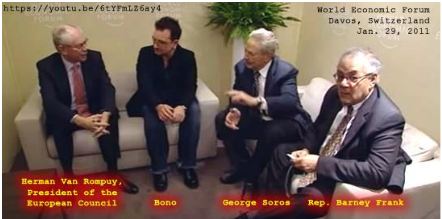
Fig: Rep. Barney Frank (D-MA) is Michael E. Horowitz's mentor.